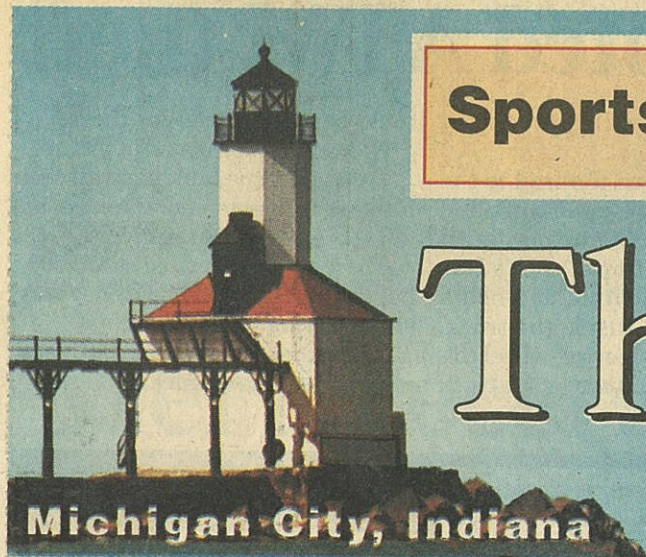
Michigan City, Indiana